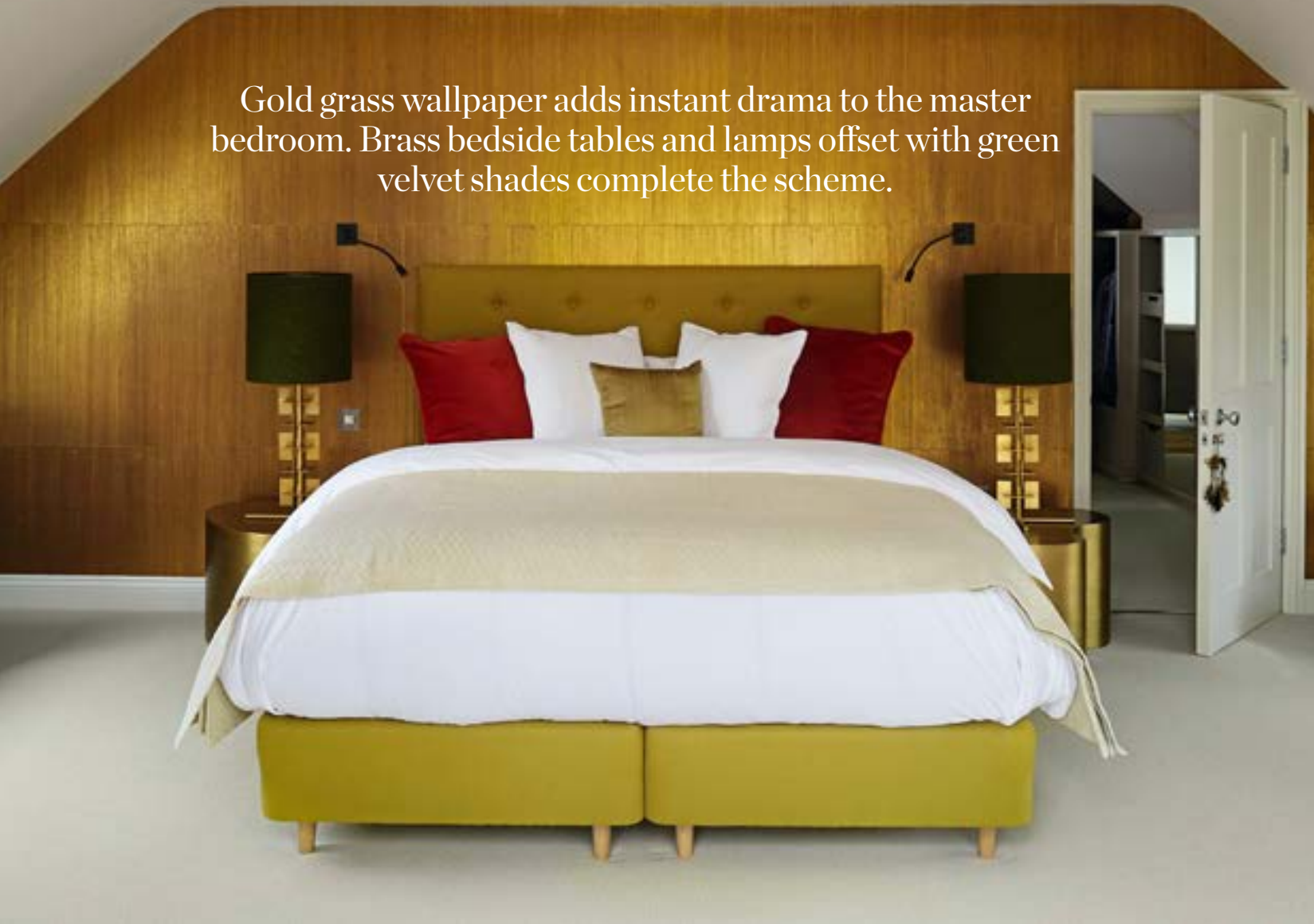
Gold grass wallpaper adds instant drama to the master bedroom. Brass bedside tables and lamps offset with green velvet shades complete the scheme.